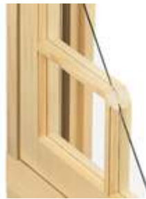
Authentic Glazing Bar

* Traditional bespoke mouldings are also available