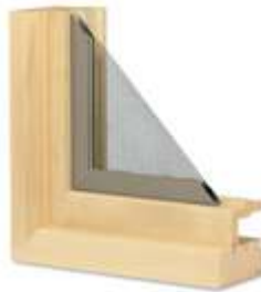
Charcoal Fiberglass *