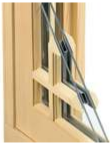
Simulated Glazing Bar with Spacer Bar

Authentic Glazing Bar - Separate pieces of glass are glazed between muntin bars-the way windows have been made since the beginning. Only now, Marvin's state-of-the-art design adds energy efficiency to traditional appeal.