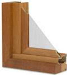
High Transparency Mesh *