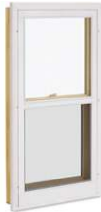
Two-lite Wood Storm Sash or Screen