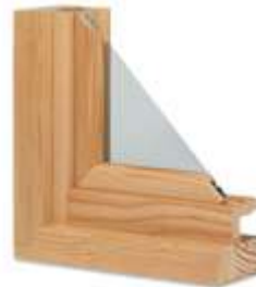
Charcoal Aluminium Wire