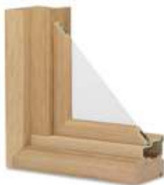
Bright Aluminium Wire