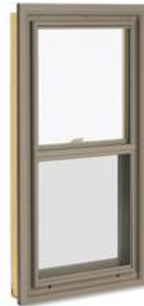
Storm and Screen Combinations