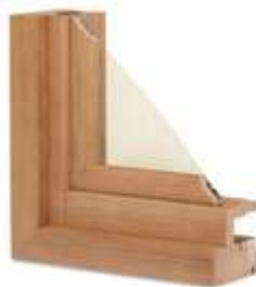
Bright Bronze Wire

* Charcoal Fiberglass mesh is standard on both wood and aluminium screen surrounds.