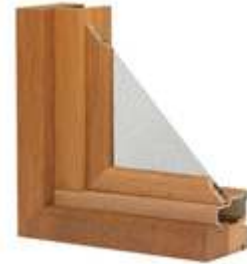
Black Aluminium Wire