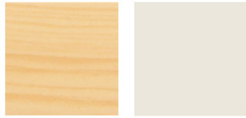
Bare Wood (pine)

Wood-Ultrex doors feature solid-wood, pine interiors in a bare wood finish that is ready for painting or staining or a factory-applied semi-gloss white paint.