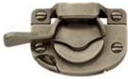
WD10 Sash Lock and Keeper