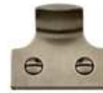
WSL20 Finger Sash Lift