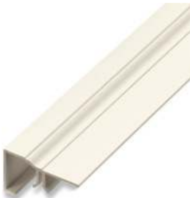
Brick Mould Casing

Marvin Exterior Trim Solutions are now offered on all rectangular Wood-Ultrrex and All Ultrrex products. Which means the same durability, performance and look you get in your Marvin windows and doors can be extended to your trim. Create a new dynamic look knowing your corners and colors will stay true and enhance your project's finished appearance.