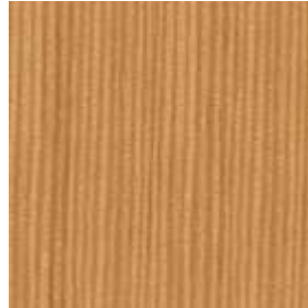
Vertical Grain Douglas Fir