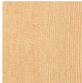
Vertical Grain Douglas Fir